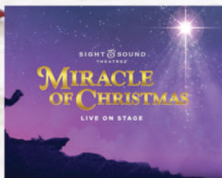
SIGHT & SOUND SHOW