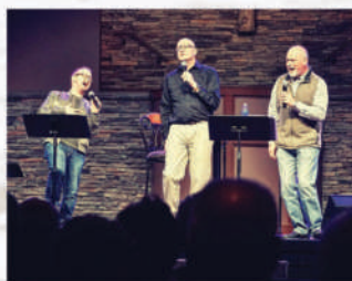
ANTIOCH VOCAL BAND CONCERT