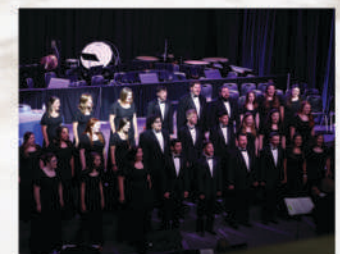
CBC CHOIR CONCERT