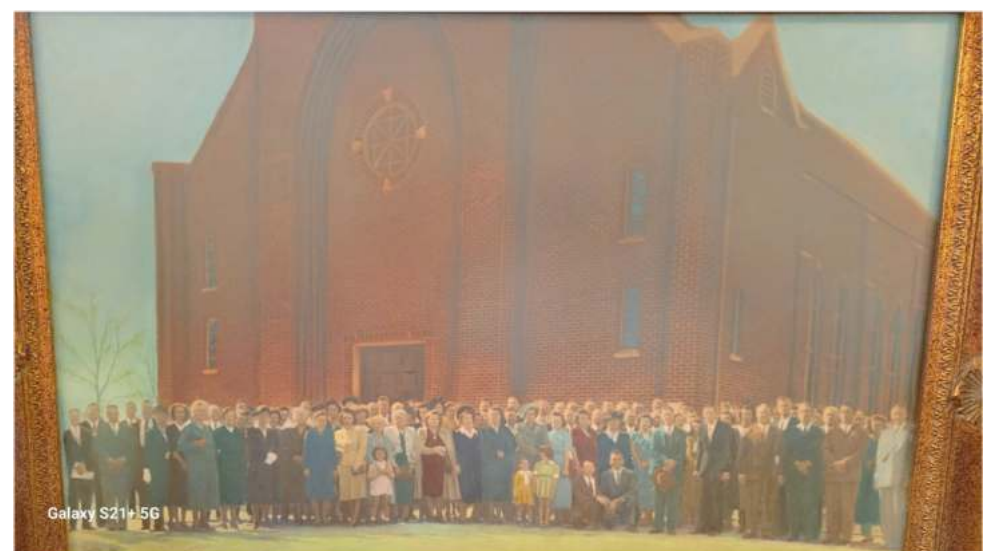
Pictured above is the original photo of those attending the 1948 annual meeting

Cost is $10.00 per copy with a $3.00 mailing fee