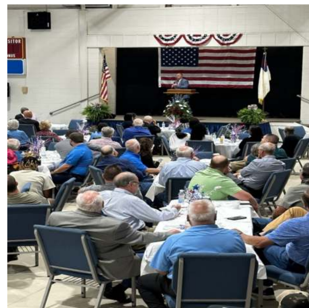
The National Day of Prayer for Jones County is scheduled for May 2, 2024, in the Gymnasium of Southeastern Baptist College