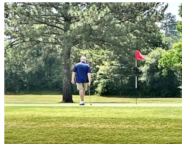
The Annual SBC Golf Tournament will be on May 24 at the Laurel Country Club