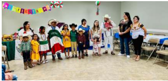
El Camino, Hattiesburg

It is also a pleasure to share with you the progress made in the