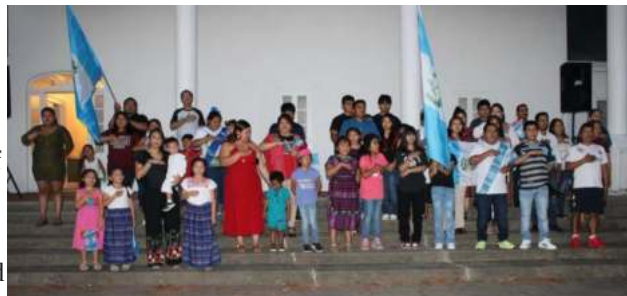
Hispanic Independence Day Celebration

everyone to continue serving our Great God and win many souls for Jesus.