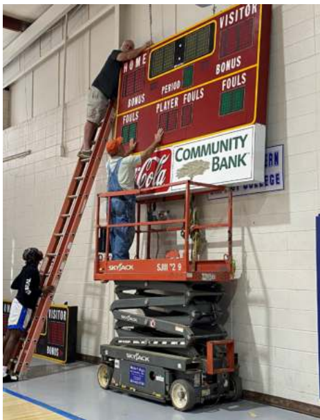
An updated scoreboard replaces the old one in the college gym