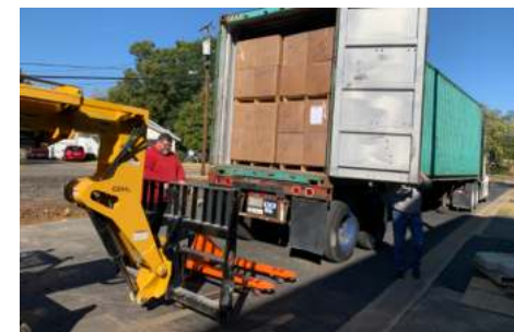
Loading shoeboxes for Ukraine

lies receive material gifts, but more importantly, the best gift of all—a relationship with Jesus Christ.