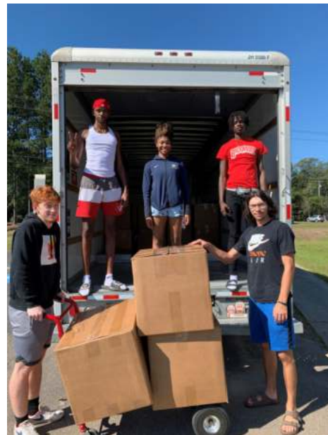
Students loading Christmas Shoeboxes for our BMA of MS churches