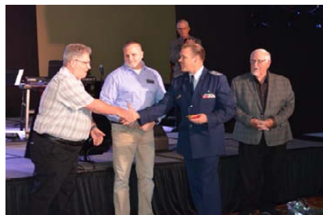
New church messengers welcomed helping our churches in eastern Europe minister to those most effected by the war.

With the invasion in Ukraine and the relief efforts by many of our churches, Smith emphasized that every dollar given for Ukraine relief is going to the field and