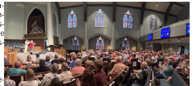
A great turnout at the 2022 Southeastern Gospel Fest