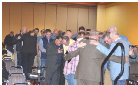
Pauls & Timothys praying for each other