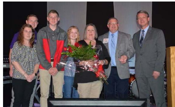
The Newsom Family