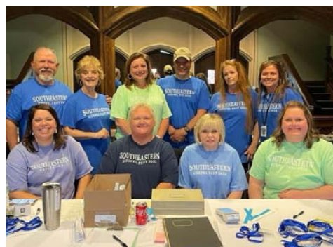
The awesome supporting SBC staff for the Gospel Fest