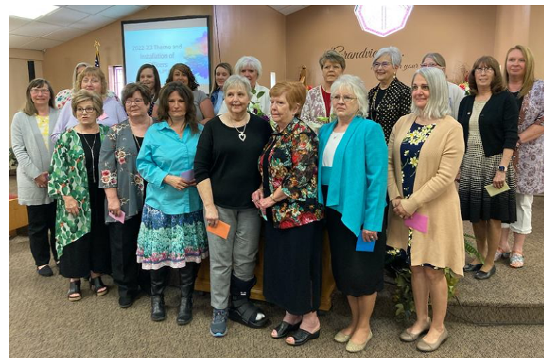
National WMA Officers

5) We give $1,000.00 from the general fund to BMMI.