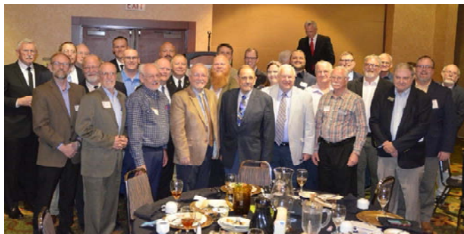
Alumni attending the annual Seminary Dinner

The closing service historically has been the missionary commissioning service. New missionaries were recognized along with a host of current missionaries from around the world as well as a number of others serving in various missions related positions.