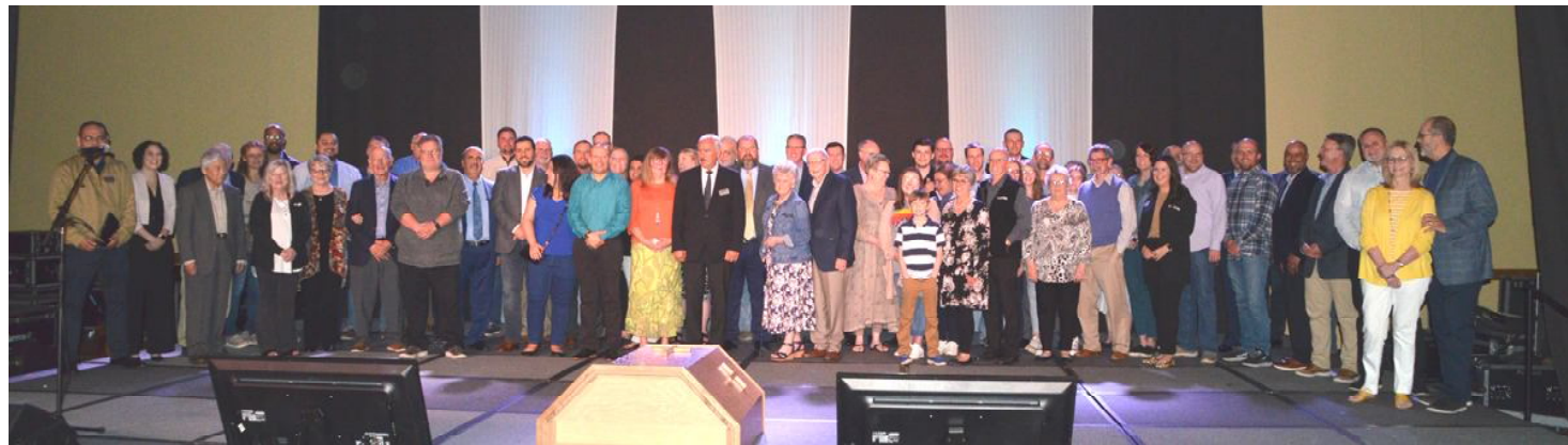
BMA Annual meeting closing with missionary commissioning service