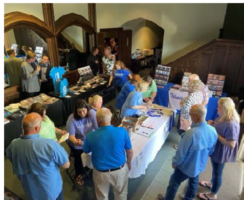
SBC Staff members in action at the Gospel Fest