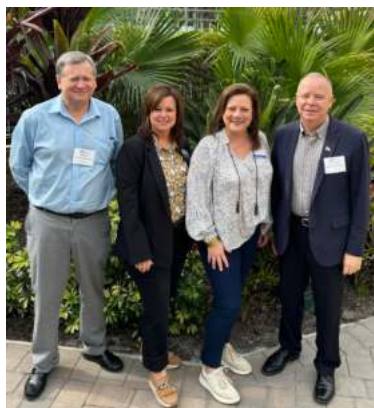
SBC Staff and Chairman of the