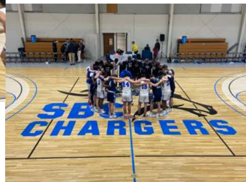
Chargers post game prayer with BJU team.