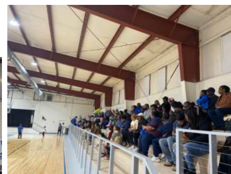
A good turnout for the BJU game.