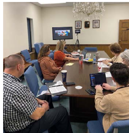
On the left- Bible professors meeting on Zoom and in person to discuss development of future ministry degree paths

First impressions are extremely important in decision making process for parents and students as they visit our campus.