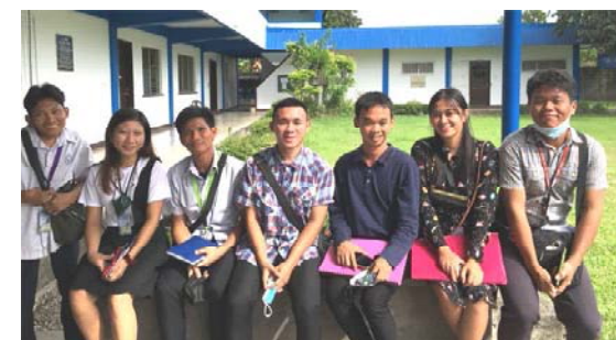
Bible College Scholarship needs

We are looking for eight people to sponsor eight needy and deserving students for just $100 a month. This includes their room, board, tuition, food, and medical expenses. We will send you a photo and a bio of “your student” and updates on their progress. Please contact us on Messenger “Elwin Doug Diane Lee” or email us, if you or your church would like to make a difference in these young men and women’s lives. Email address is edouglee70@gmail.com or dianehusserlee@gmail.com .