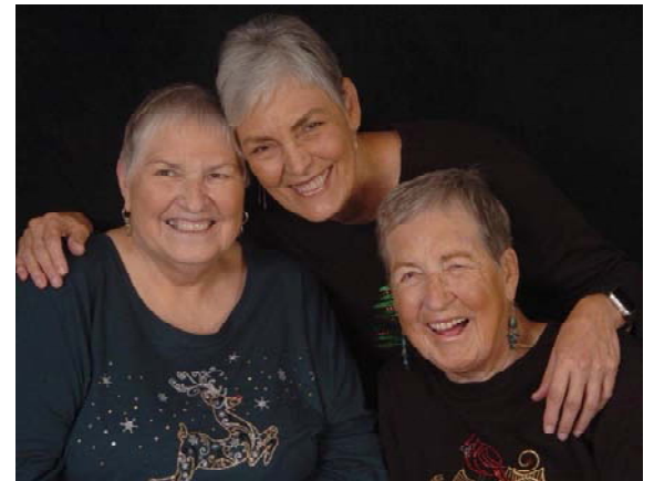
Three Sisters Smiling

I found a card recently that Middle Sister sent after Daddy died; I had forgotten about it. "After Mother and the Diva died, I knew I would not only lose him when he died but also my two