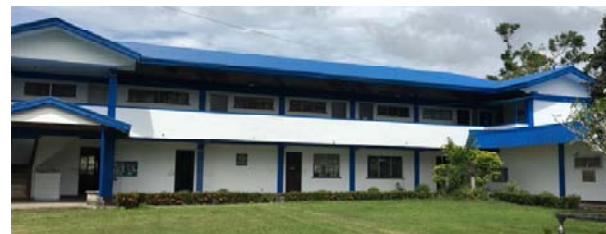
BUILDING FACE-LIFT FOR SECOND SEMESTER

This is our fourth year to celebrate “World Mission Day” at the Bible College here in the Philippines. It has been a great way to emphasis the importance of missions and church planting to our students. This was our first chapel back after having to split into two groups during local co-vid requirements.