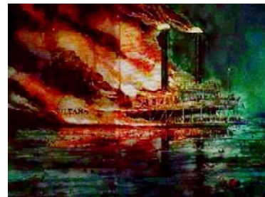
Burning of the Sultane

The other piece of history that caught my attention was the Sultana Monument to the disas-