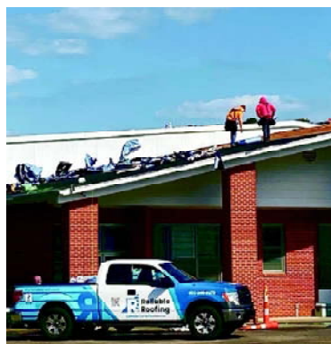
Gymnasium receives a new roof