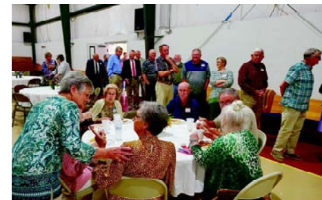
Fellowship and Food