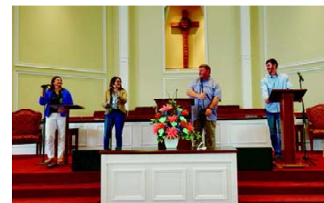
Music for the day