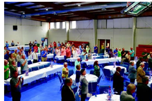
Crowd pledging allegiance to the flag