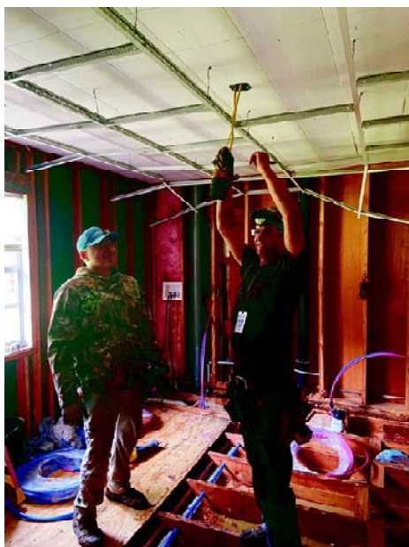
Expansion of the Granbury Hall upstairs bathroom