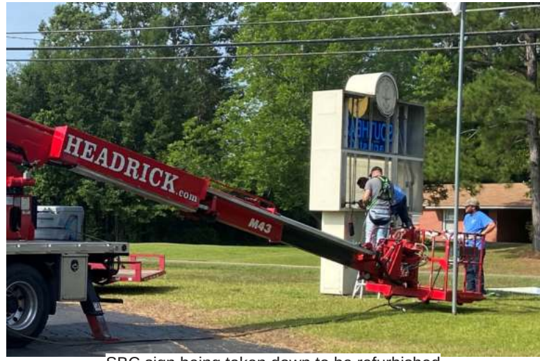
SBC sign being taken down to be refurbished