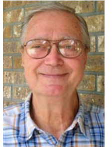
James Hall Maintenance