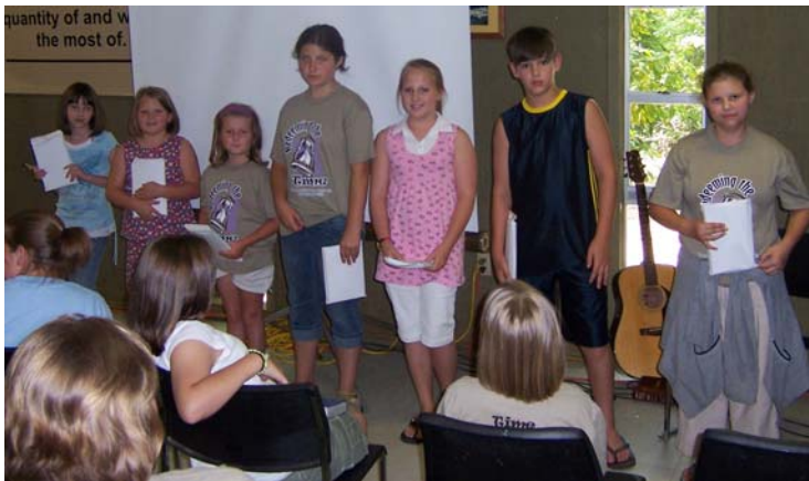
Pictured above are some of the 8 children saved at the 2007 Harmony Association Camp held at Tishomingo State Park.

The theme of the Harmony Baptist Encampment was "Redeeming the Time." There were 122 full-time campers with visitors each service. There were 8 saved during camp.