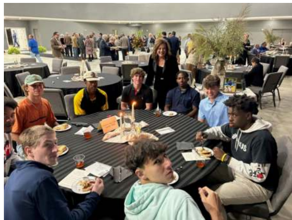
Students who helped with the 75 th Anniversary Gala