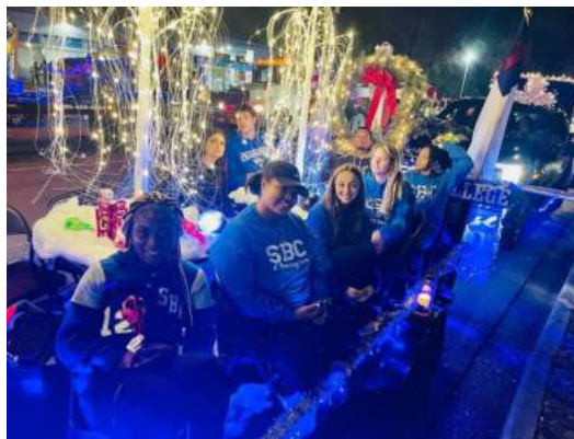
Students field float in Laurel's Christmas Parade