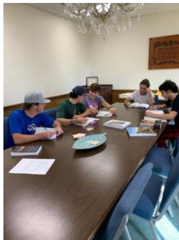
Students studying for Fall Semester finals