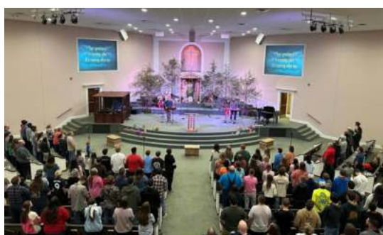
Renew Worship Time