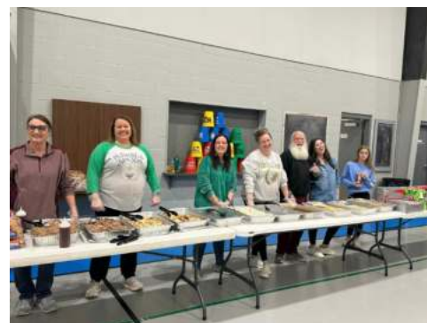
Bethel Church Workers