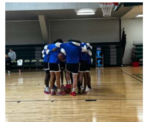
Chargers Pregame Prayer at Delgado College