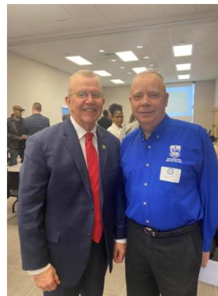
Dr. Carson Meets U.S. Congressman Mike Ezell