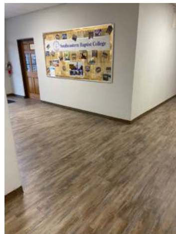
Right Photo Beautiful new flooring