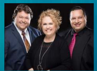
Special Concert New Ground

Great Fellowship - Music - Food - Prizes - Surprises and a Wonderful Day of Worship