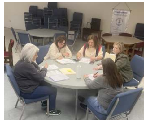
Staff Planning for the Spring Semester