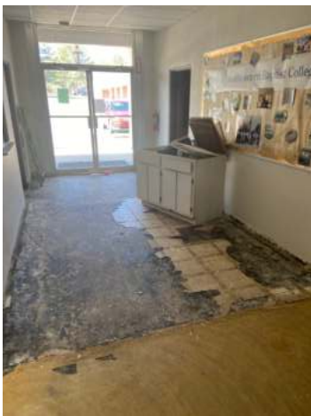
Left Photo Removing old flooring