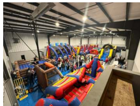
Late Night Activities