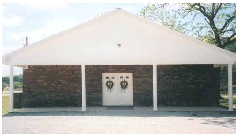
Walnut Grove Baptist Church