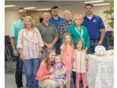
Below - SBC faculty and staff celebrate Sandy's service