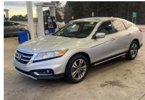
The "Silver Bullet"

It has been my goal to be at every local association possible. If I have not got to your group yet, it is my aim. Please let me know when your meetings are. If it is feasi-