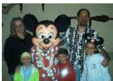
Unsuspecting Family with Mickey