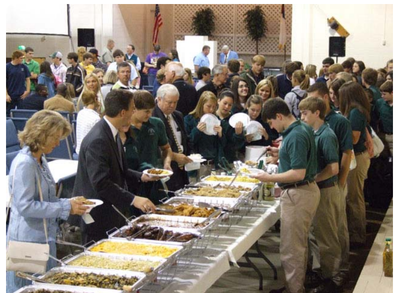
A group of over 300 enjoyed the noon meal at SBC's recent College Day

The College Day on campus, April 10, was a great success. Six Christian high schools brought groups. Two of those brought choirs who sang for the college day program. Several other individuals also attended. There were at least 200 guests on campus that day, including 175 prospective students. A good message was preached in chapel and a former student furnished and